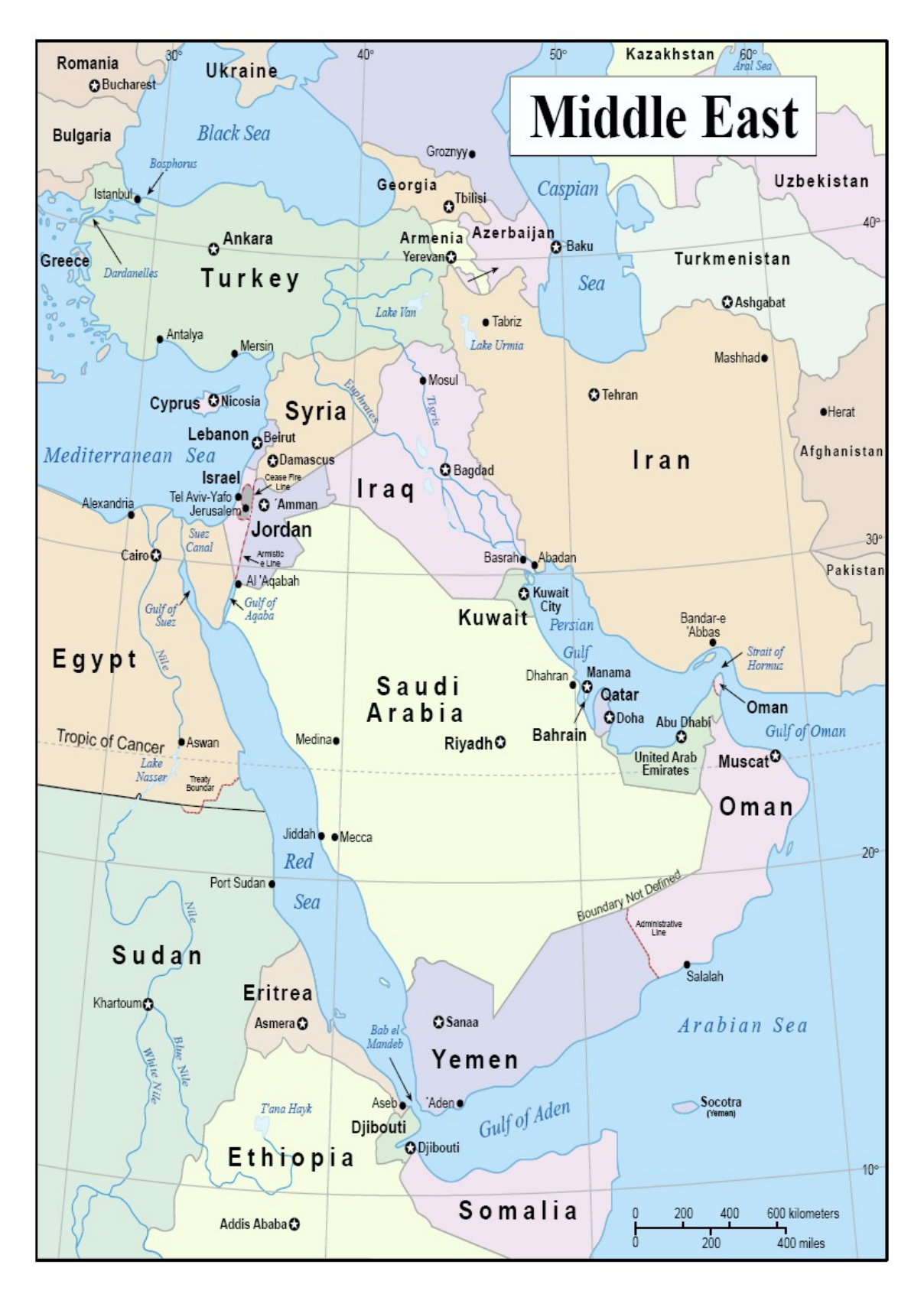
Figure 3: Regional map